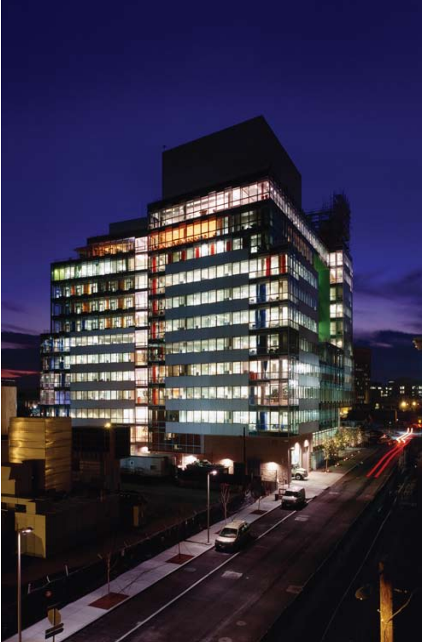
Genzyme Center, Cambridge, Mass., AIA/COTE 2004 Top Ten Green Projects award recipient. Behnisch, Behnisch and Partner Architect, Venice, Calif.

costs even if they will gain financially in the long-run. Grants and loans may be two ways to help small businesses build green and can be especially effective in jurisdictions that do not yet have established green building programs and need leaders in green design.